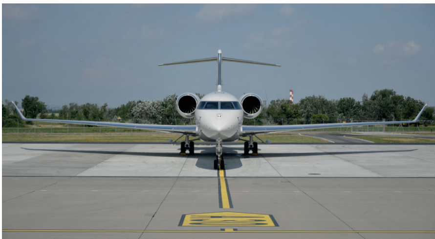
A second Bombardier Global 7500 enters SPARFELL's Charter Fleet