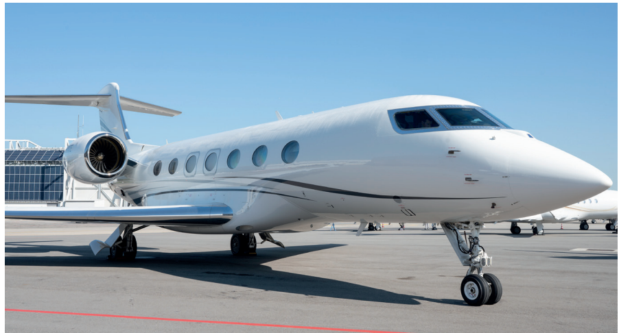
A Gulfstream G500, the 18th aircraft type to enter SPARFELL's Charter Fleet

Currently managing eighteen different types of aircraft SPARFELL can tailor to your needs not only in theory but also in practice. Having