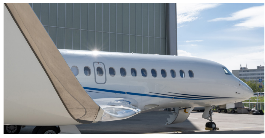
A Dassault Falcon 7X of the SPARFELL Charter Fleet